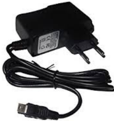
Mini USB Charger 5 V - 1 A