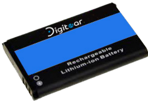
BELTPACK Spare Battery 3.7 V - 1200 mAh